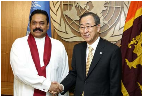
UN's Ban and Sri Lanka's President, 2862 killed civilians not shown

Another <u>leaked UN document</u> published today by Inner City Press show that the UN has its own figures for the number of civilians trapped between the Sri Lankan military and the Tamil Tigers, more than twice as high as the government's claimed numbers. The UN document put the number of internally displaced people in Mullaitivu at 150,000 to 190,00, and says that the International Committee of the Red Cross agrees. The UN then dryly but telling reports on "70,000 -- the number of IDPs in Mullaitivu according to the Government of Sri Lanka (GoSL)."