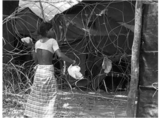
Enraged woman of Edesmetta throwing a stone at the Gangalur police station

abused the local police as well as the CRPF and threw stones at the police station. That adivasi women pelted stones on a police station in an area where even the presence of the police is highly intimidating to the average citizen speaks volumes. The police merely watched on. Would they have been silent if their conscience was clear and there really was an exchange of fire? The women later took the bodies back to Edesmeta and cremated them the same evening.