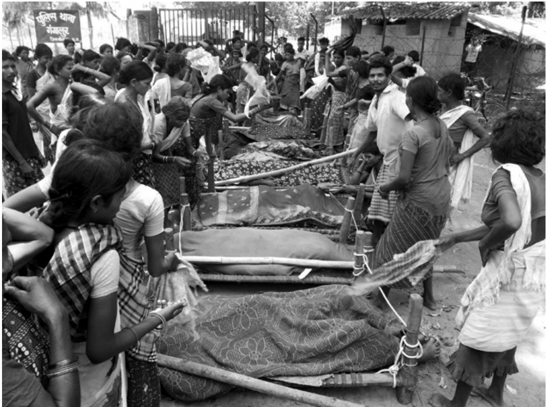
Edesmetta villagers with bodies of the deceased outside the Gangalur police station

A post-mortem was conducted by a panel of doctors at the Community Health Center, Gangalur the next morning (May 19) after which the bodies were handed