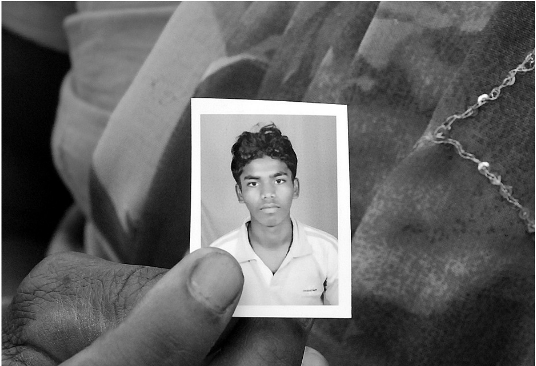
One of the minor boys killed by the CRPF at Sarkeguda

Our adivasis have similarly been caricatured and imprinted as less-than-human in our minds over several generations. This makes the violence imposed on them seem insignificant and the resultant suffering invisible. As truly civilized beings, and not as our predecessors who used "civilization" as an excuse to brutalize and exploit, it is time that we begin to see the humanity in our adivasis and the inhumanity of our actions against them. This report is to help us do that – to begin by educating ourselves about and acknowledging the immense and entirely unacceptable suffering inflicted on our so-very-human adivasis by our not-so-human governments and police.