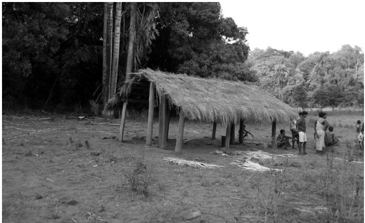
Site of massacre in Edesmetta

On the night of May 17, 2013, adivasis of Edesmetta were performing the Beeja Pandum, the seed festival normally held at that time of the year before the rains arrive and sowing begins. Over a 100 adivasis had gathered around a small structure containing their deities known locally as 'gaama'. The Beeja Pandum on May 17 (Friday) was the last of the four-day long festivities that were held during the evening-night. The adivasis had congregated at the place which is an open field and about a 10 minute walk from the village.