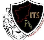
International Tamil Society Imperial College